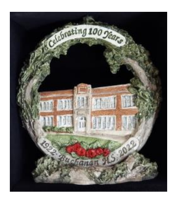
Buchanan Scarecrow Charities

Buchanan High School Celebrating 100 Years