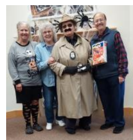
Fun times at the BASC Halloween Party!